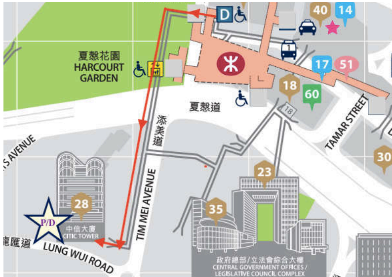
CITIC Tower - Lung Wui Road 中信大廈 - 龍匯道